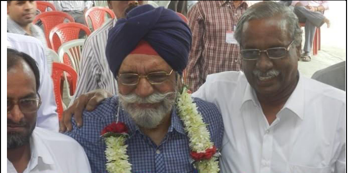
Central President & General Secretary arrives