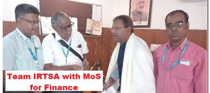
Team IRTSA with MoS for Finance