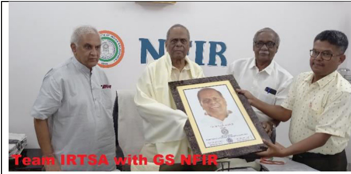
Team IRTSA with GS NFIR