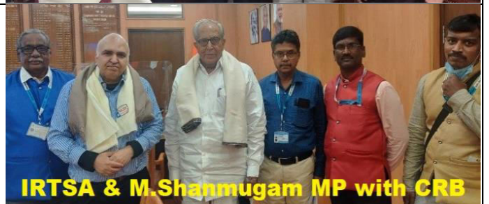
IRTSA & M.Shanmugam MP with CRB