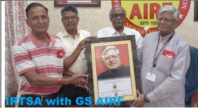
IRTSA with GS AIRF